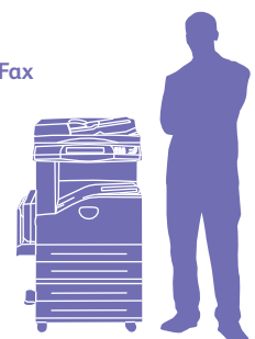
WorkCentre 5230 with two-tray module