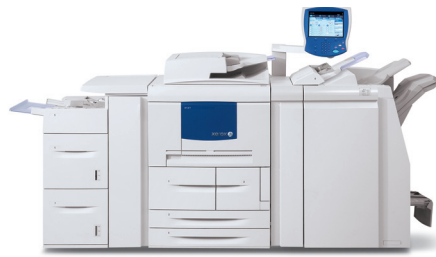
Xerox 4112/4127 Copier/Printer