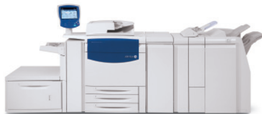
Xerox 700 Digital Color Press